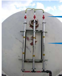
Diagram for using Well water to be RO'ed and then Activated & Amplify Oscillation for Agricultural use [Herbicides Pesticides & Foliar mixing]